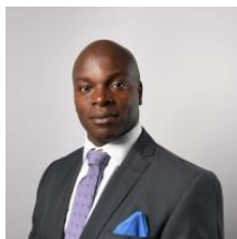
Shaun Bailey AM Conservative

The Environment Committee examines all aspects of the capital's environment by reviewing the Mayor's strategies on air quality, water, waste, climate change and energy.