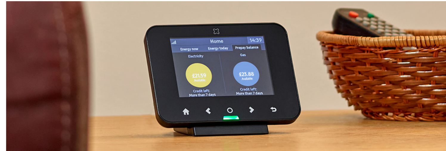
This image shows how a typical prepay in-home display looks. Prepay in-home display and figures are for illustrative purposes only.

If you have a prepay smart meter, you will receive the £400 grant from the Energy Bills Support Scheme automatically credited onto your smart meter.